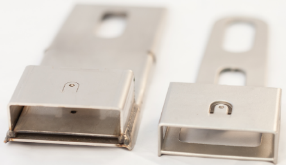
Before and after: fabrication converted into a casting